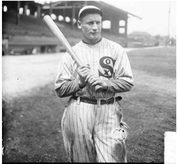
In 1919-20, the White Sox rallied from a late deficit to win 32 games, the most in baseball during that period. Happy Felsch, above, drove in the go-ahead or winning run in six of those games.

One of the White Sox's late-game rallies clinched their 1919 American League pennant. On September 24, 1919, the St. Louis Browns took a 5-2 lead into the bottom of the 7th inning at Comiskey Park. The White Sox chipped away with two runs in the 7th and were down by one entering the 9th. After Buck Weaver's sacrifice fly tied the score at 5-5, Joe Jackson smashed a line drive single to right-center, scoring Nemo Leibold with the pennant-clinching run. Only two other times in the pre-divisional era did a team clinch a pennant in a walkoff victory: Bobby Thomson's "Shot Heard 'Round the World" for the New York Giants in 1951 and Hank Aaron's 11th-inning game-ending home run for the Milwaukee Braves in 1957.