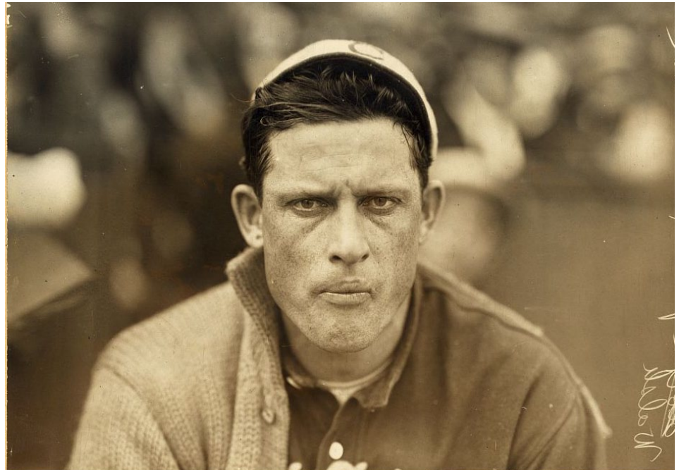
Hall of Famer Ed Walsh had his last great season with the Chicago White Sox in 1912, finishing with a 27-17 record and a 2.15 ERA in 393 innings pitched. He also pitched an exhausting 41 innings in the postseason City Series against the Cubs, leading the White Sox from an 0-3 deficit to victory.

The first decade of the 20th century saw the White Sox emerge as one of the American League's powerhouse clubs, capturing two pennants in 1901 and 1906 and narrowly missing one more in 1908. Their run of success culminated in a surprise World Series championship in 1906 over the Cubs, who set a major league record for wins